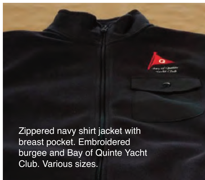
Zippered navy shirt jacket with breast pocket. Embroidered burgee and Bay of Quinte Yacht Club. Various sizes.