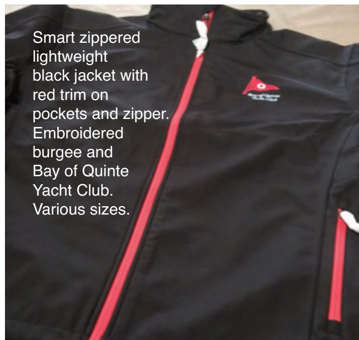
Smart zippered lightweight black jacket with red trim on pockets and zipper. Embroidered burgee and Bay of Quinte Yacht Club. Various sizes.